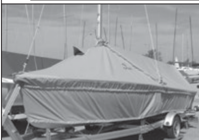
Skirted Mooring Cover above. We also make "Mooring" without skirt, Trailing-Mooring, Mast, T-M Skirted, Bottom, Cockpit, Rudder, Tiller covers.

www.sailorstailor.com (Order Covers On-Line or Call Toll-Free)