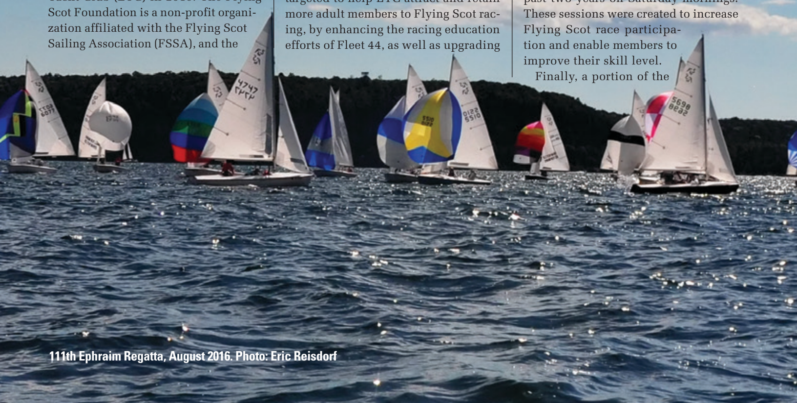
111th Ephraim Regatta, August 2016.