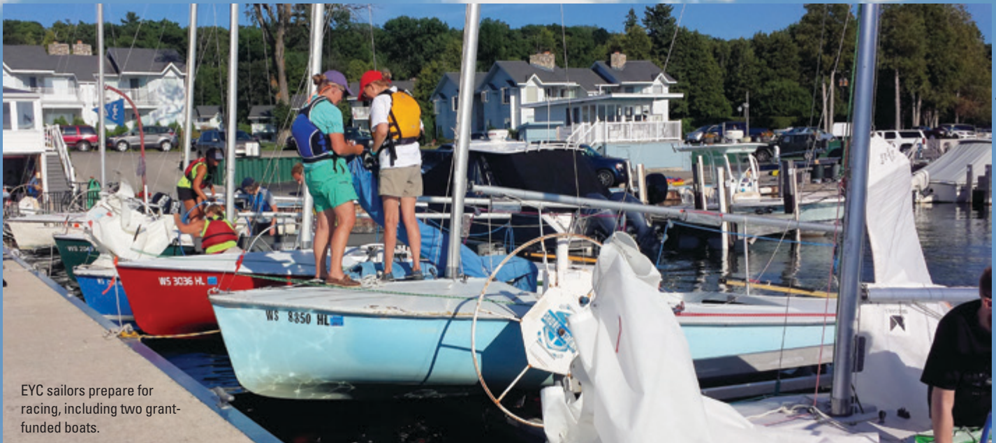
EYC sailors prepare for racing, including two grant-funded boats.