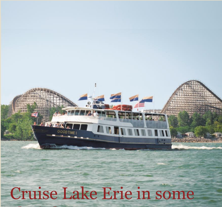
Cruise Lake Erie in some else's boat!