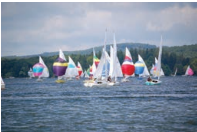
The Championship Fleet rounds the leeward mark in the 2013 Sandy Douglass Memorial Regatta.