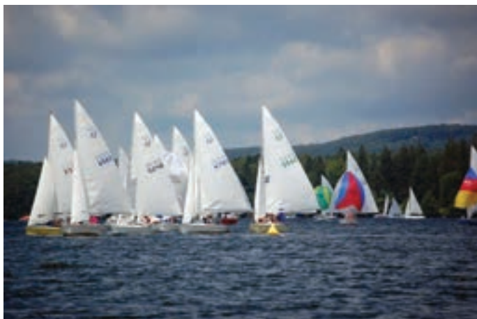
Flying Scots pinwheel around the leeward mark in the 2013 Sandy Douglass Memorial Regatta.