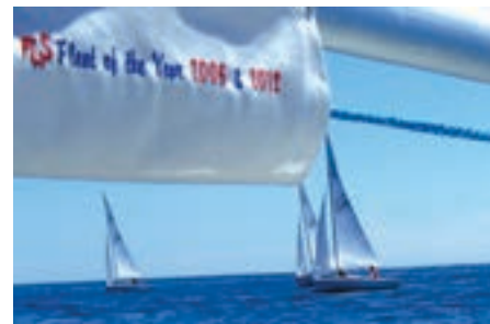
View off the stern as we finish race 2