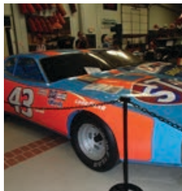
At the museum, Richard Petty's old car.