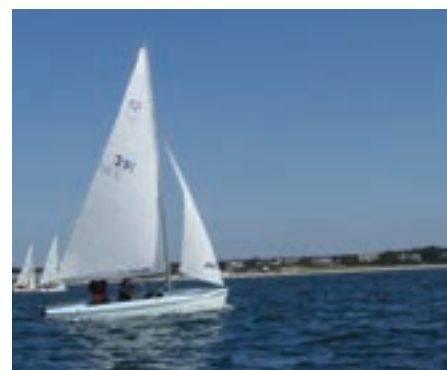
ac Man brought back memories of when she was sailed at Massapoag years ago