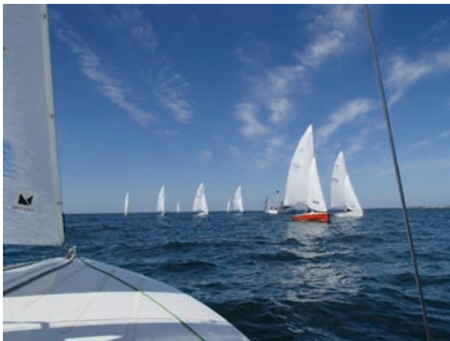
Above: View off the bow as we wait to race - looks like the clouds are pointing the way. Below: MYC Rock Stars - The Massapoag winning teams.