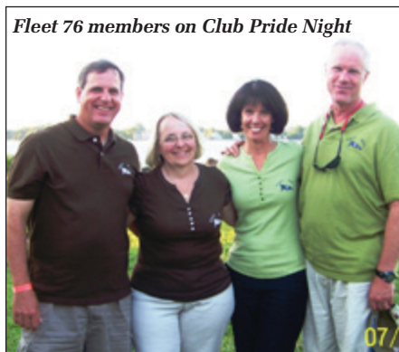
Fleet 76 members on Club Pride Night