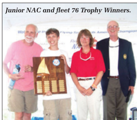
Junior NAC and fleet 76 Trophy Winners.