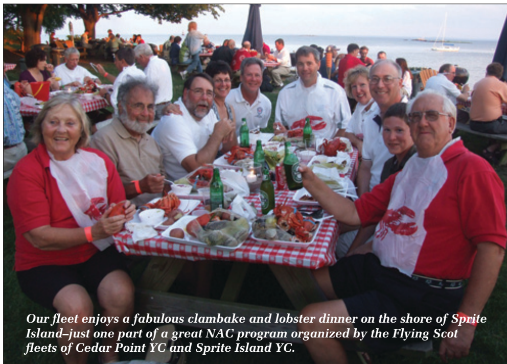
Our fleet enjoys a fabulous clambake and lobster dinner on the shore of Sprite Island—just one part of a great NAC program organized by the Flying Scot fleets of Cedar Point YC and Sprite Island YC.