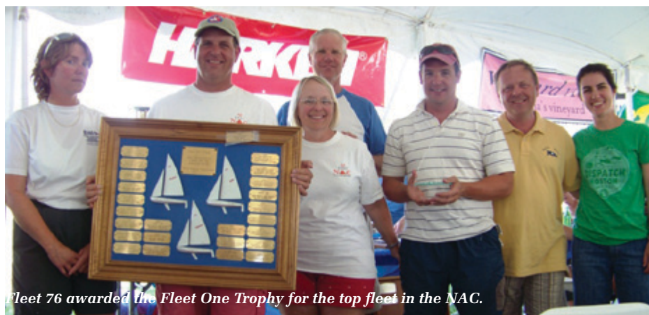
Fleet 76 awarded the Fleet One Trophy for the top fleet in the NAC.