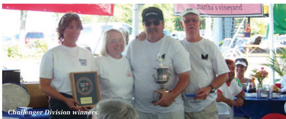
Challenger Division winners.