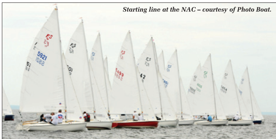
Starting line at the NAC – courtesy of Photo Boat.