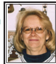
Photo and Writing Participation Awards

I would like to take this opportunity to thank all of those who submitted articles and photos this year. The following awards were presented at this year's NAC's in Westport Connecticut: