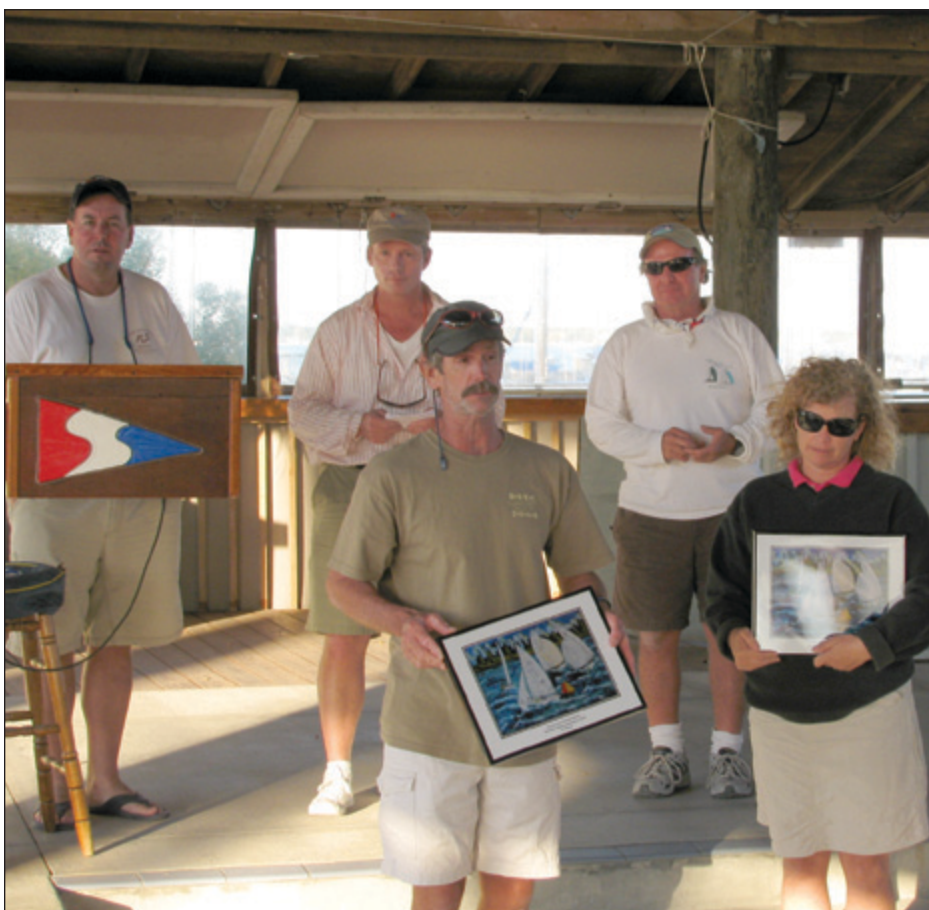
Winners of the Florida District Championship