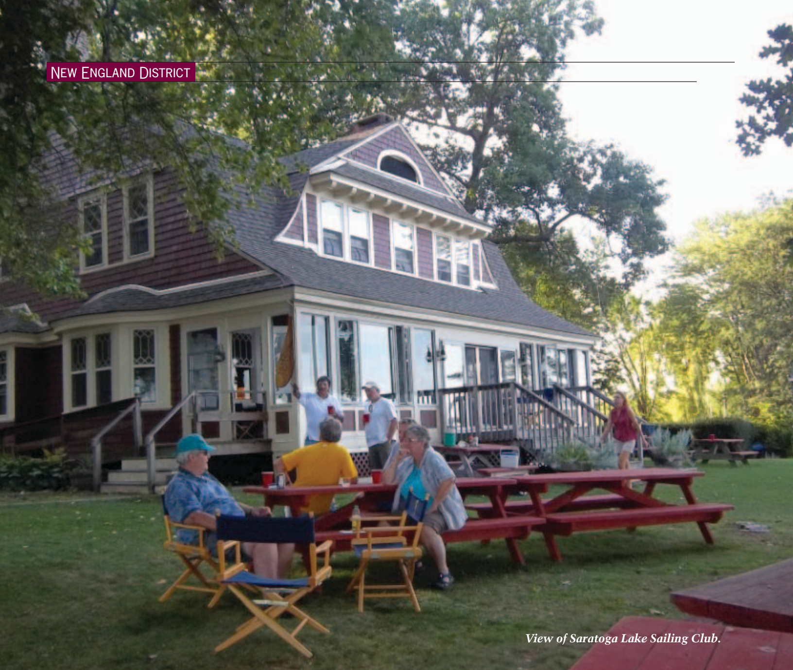
View of Saratoga Lake Sailing Club.