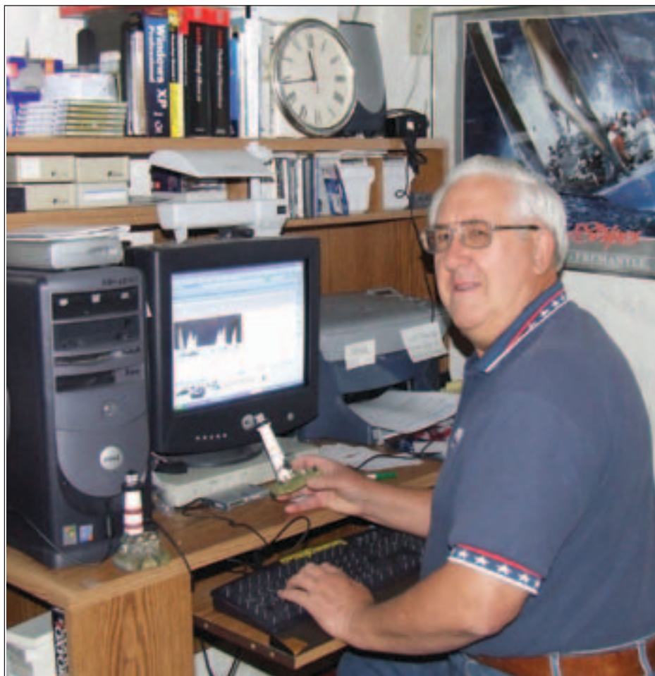
A fleet secretary burns the midnight oil to meet a Report deadline – and contemplates the next winner of a Lighthouse Award.

The key to success of a weekly Report is to be relevant to the fleet members. Each week we cover the racing and/or cruising activities of the fleet, and every participant in these activities—skipper and crew-