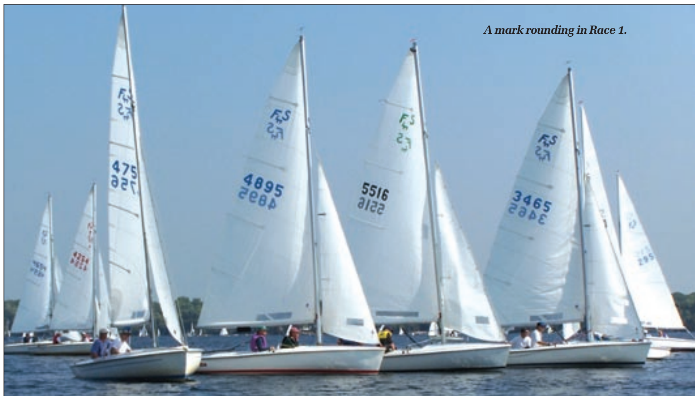
A mark rounding in Race 1.