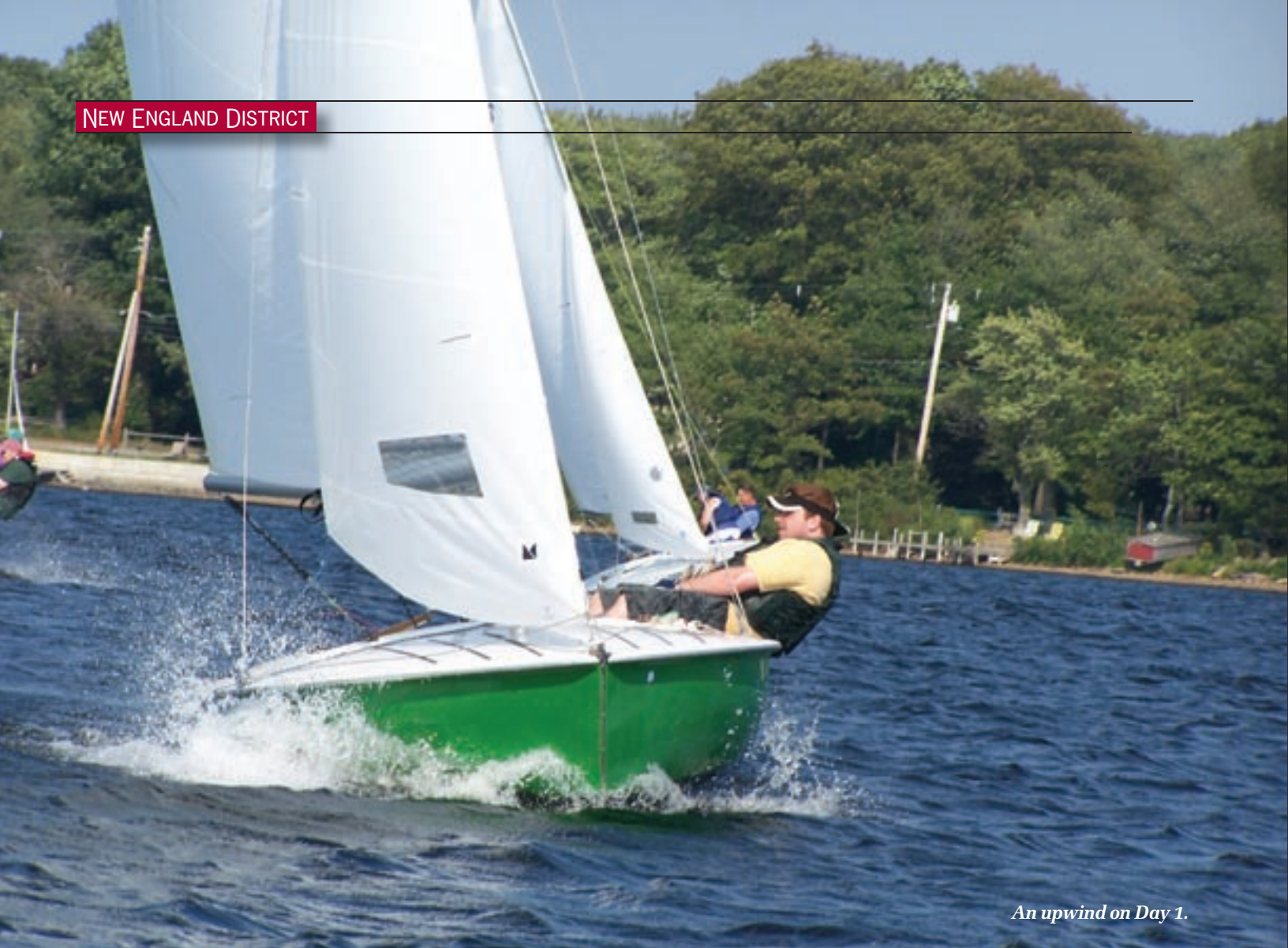
An upwind on Day 1.