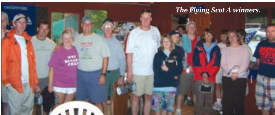
The Flying Scot A winners.

By 6:00 a.m., it appeared that NOAA was wrong again (it was muggy and still about 80 degrees), but they were right about the “no wind” part. But at 8 o’clock, the rain came; when it was over, there were two things changed – it was now 65 degrees and there was wind. I guess two out of three was not bad, especially since Mother Nature took away the heat and the rain and left the wind.