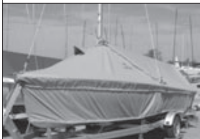
Skirted Mooring Cover above. We also make "Mooring" without skirt, Trailing-Mooring, Mast, T-M Skirted, Bottom, Cockpit, Rudder, Tiller covers.

www.sailorstailor.com (Order Covers On-Line or Call Toll-Free)