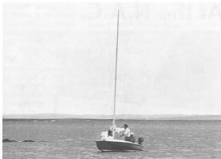
"Casting for blue"

Just east of us is Cockenoe Island with a partially hidden interior lagoon, a delightful spot for a dip or a picnic. A few miles further east is incredibly beautiful Southport Harbor nestled deep in the heart of a narrow waterway lined with stately colonial mansions reminiscent of a bygone era. Then there's Fairfield Beach, Black Rock Harbor, the Housatonic River, and Stratford, with