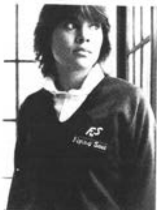
Flying Scots Insignia in red and white on navy blue Mariner V.

Beautifully embroidered...the Mariner V is a blended Cresian garment that holds its shape through repeated washings...an ideal weight for year round wear.